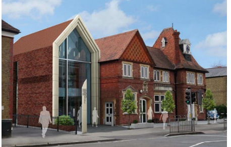
Merton Hall/Elim Church