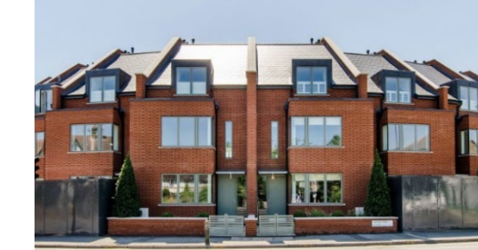
Kingston Road Quadrant